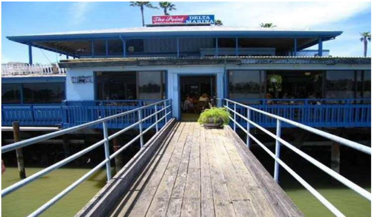
The Point Restaurant 120 Marina Dr, Rio Vista 1-707-374-5400

After lunch you will be on your own for the return home.