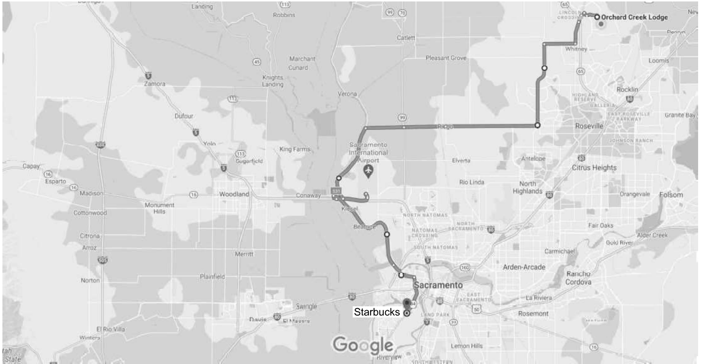
Map data ©2021 Google 2 mi